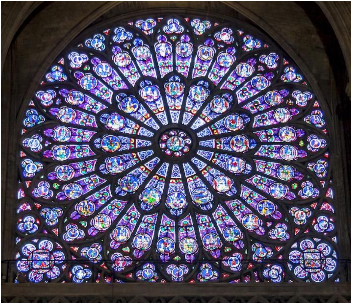
The Rose window of the Notre Dame Cathedral

Last year I had the very unusual experience of having to celebrate the Easter Triduum on my own. Please God that will be an experience that will never be repeated. This most assuredly is my prayer; that the pandemic may soon be behind us and that things may return to normal.